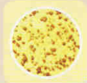
Patches of mould