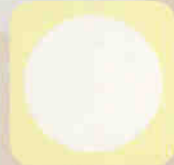
No appearance of mould

Mould is a fungus which grows from airborne spores present in the air. These spores grow when they come into contact with moisture. Mould is common in areas where ventilation is poor, and areas with damp surfaces like ceilings, bathrooms, kitchens and around air-conditioners. Left unchecked mould can spread.